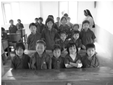
Catholic school students, Nagaland

The Kohima Diocese today encompasses the whole state of Nagaland. At present, 26 local priests serve their own people there; the first two were ordained in 1989. There are also some 80 local Religious Sisters and 160 men and woman preparing for Religious life.