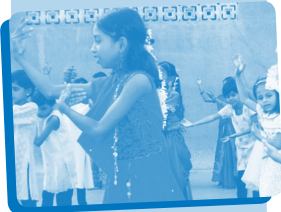
Students practice traditional dances.

Do: Fill half of the bottle with rubbing alcohol. Put two to three drops of food coloring into the bottle and shake. Fill remainder of the bottle with mineral oil, glitter and “sea life” objects. Put top on and seal with white glue. Let dry. Seal a second time with the hot glue. Do not shake. Hold bottle horizontally until clear, then raise and lower ends to create waves.