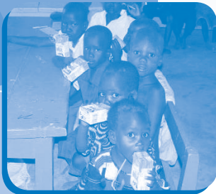
A Church-sponsored feeding program in the Diocese of Lodwar, Kenya.

Featuring activities for the It's Our World Newsletter