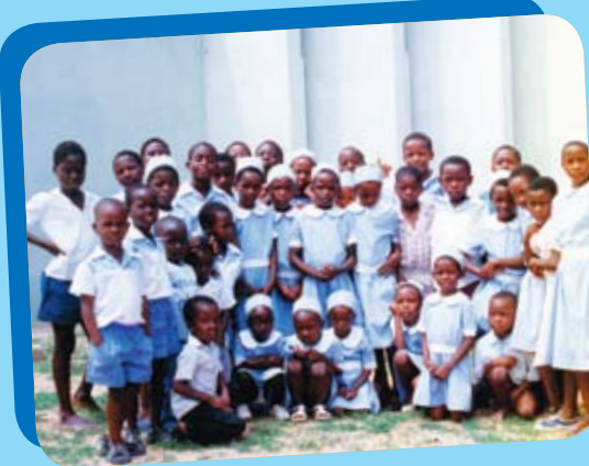
Holy Childhood groups from the diocese of Gweru in Zimbabwe

Thanks to your love and prayers, children from Gweru, Zimbabwe, are learning about the “Good News” of Jesus – the news that He loves each one of us! And, just like you, HCA kids there say prayers and offer sacrifices for their brothers and sisters in other places in the Missions.