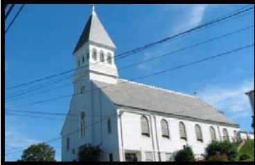
St. Francis de Sales Church serving the people of Lenni Pa. for over a hundred years