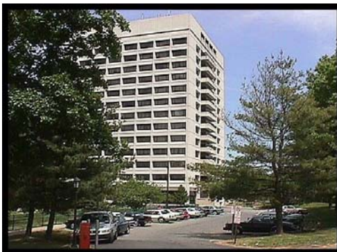
Bldg. 8 at Fair Acres, one of the many buildings on the 210 acre campus in Delaware County, Pa.

An individual minister may serve anywhere from four to sixty communicants. This ministry is the largest in the parish and requires a major commitment. We still have