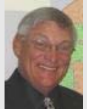
This article written by Ron Lill

2, If you're reading a printed paper copy of the InFormation and want to follow the links in any of our articles go on line to the news letter web site @ http://www.archphila.org/pastplan/newstuff/InFormation/index.html and follow the embedded links.