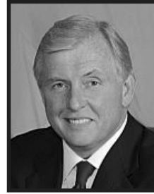
DEMOCRAT Jack Wagner

A s part of a statewide effort to educate people about candidates and their positions on issues important to Catholic voters, the Pennsylvania Catholic Conference (PCC) sent a questionnaire to candidates for statewide office to give them the opportunity to make their positions known on key specific issues. The answers they provided are listed here for educational purposes only; the PCC does not endorse candidates for political office.